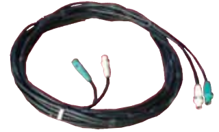
#2 Cam-lock Banded